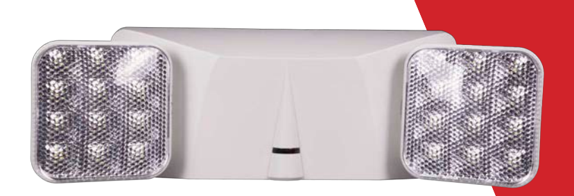
Compatible with remote heads: ERH1|2 & ERHWP 1|2