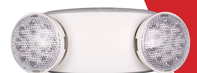
Compatible with remote heads: ERH1|2 & ERHWP 1|2