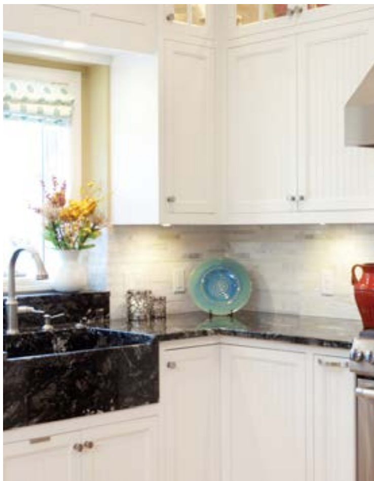
Omni Slim 3CCT Puck Series As versatile as it is sleek. Adjustable between 2700K, 3000K, 4000K as well as a black or white finish options. See Page 6