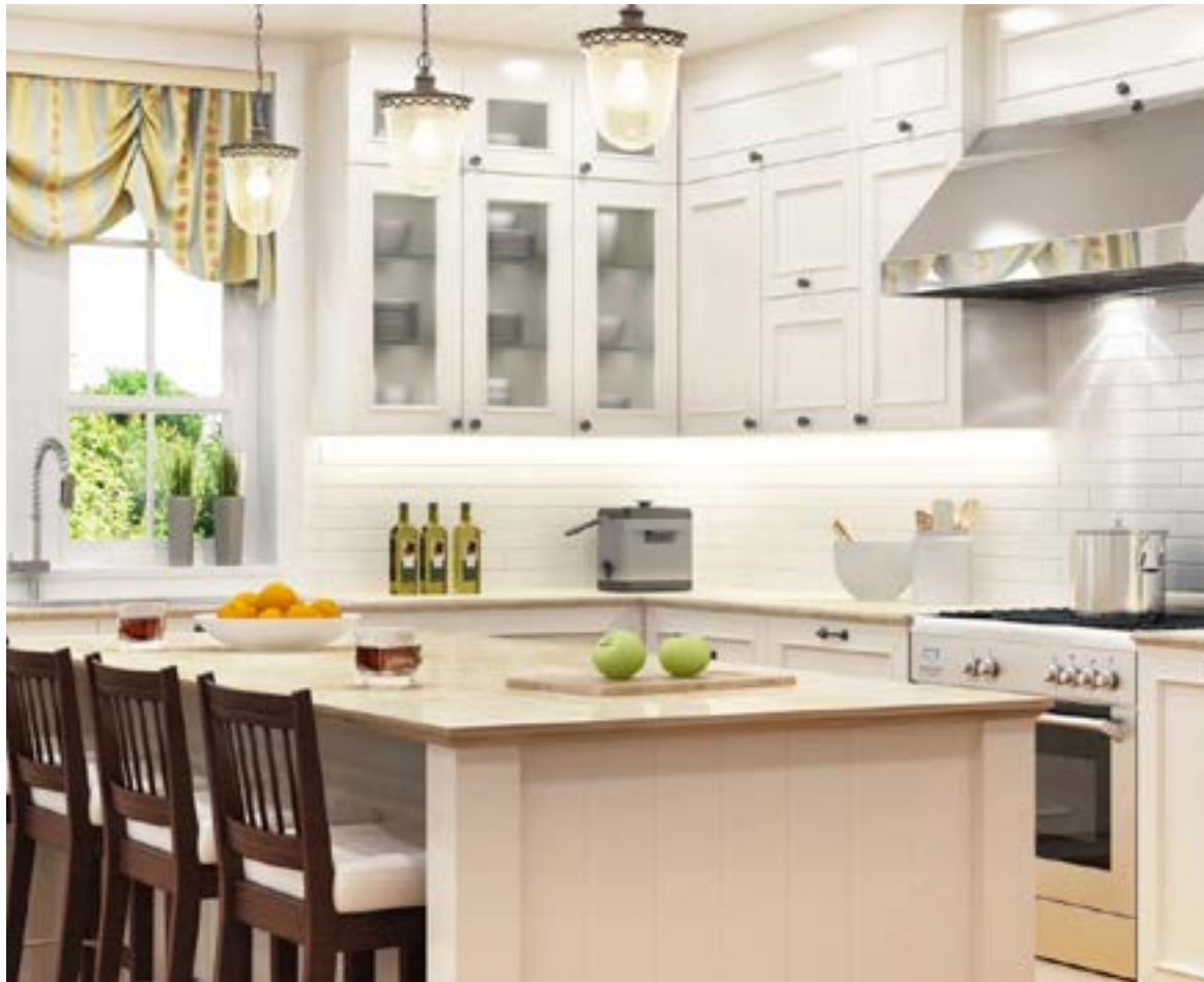
LED 5 Complete This adaptable, adjustable fixture allows for a wide range of illuminated area regardless of installation location. See Page 5