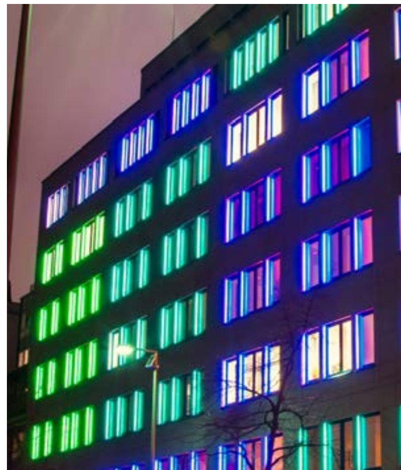
NEONFLEX PRO-V RGBW The next generation solution for achieving seamless lines of direct view lighting for any architectural-grade install. UV, flame, and saltwater resistant, Neonflex Pro is not only durable, but easy to install. See Page 7